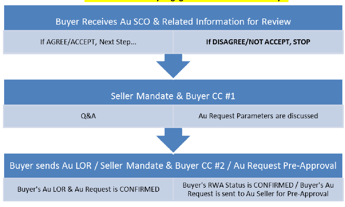
Next Step: LOI & FCO